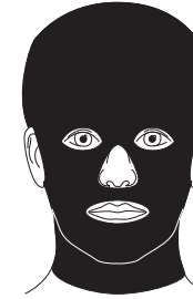
430 Face Mask