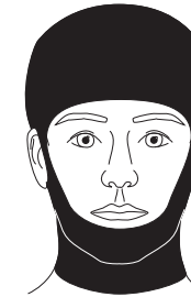
431 Open Face Mask